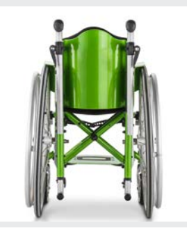
Detachable, anatomic back shell in aluminium