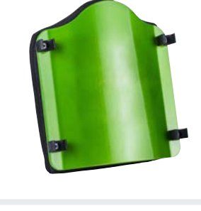
In frame colour with Flash logo