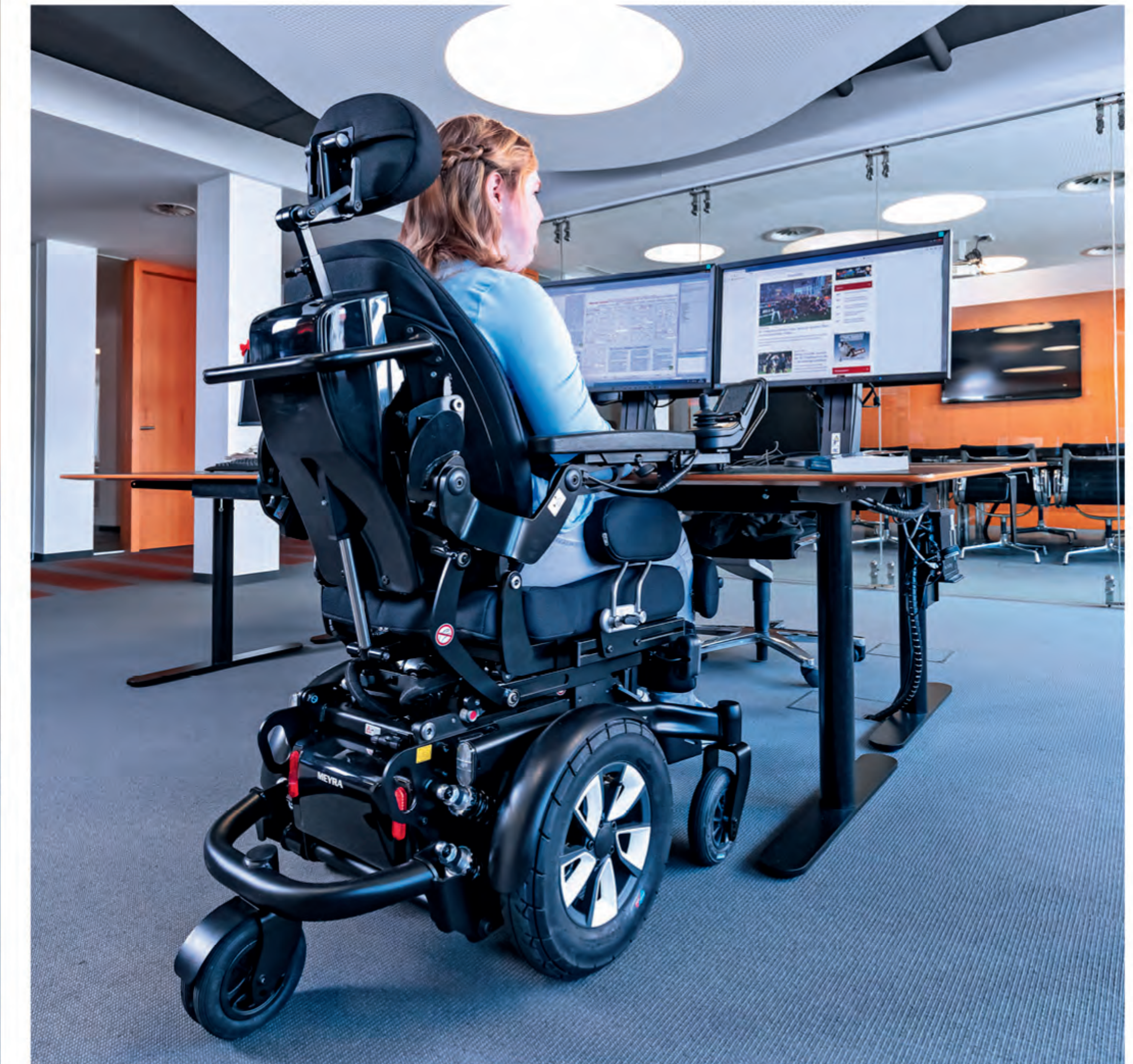
Mid-wheel drive with ideally placed castor wheels, low seat height and overall width.