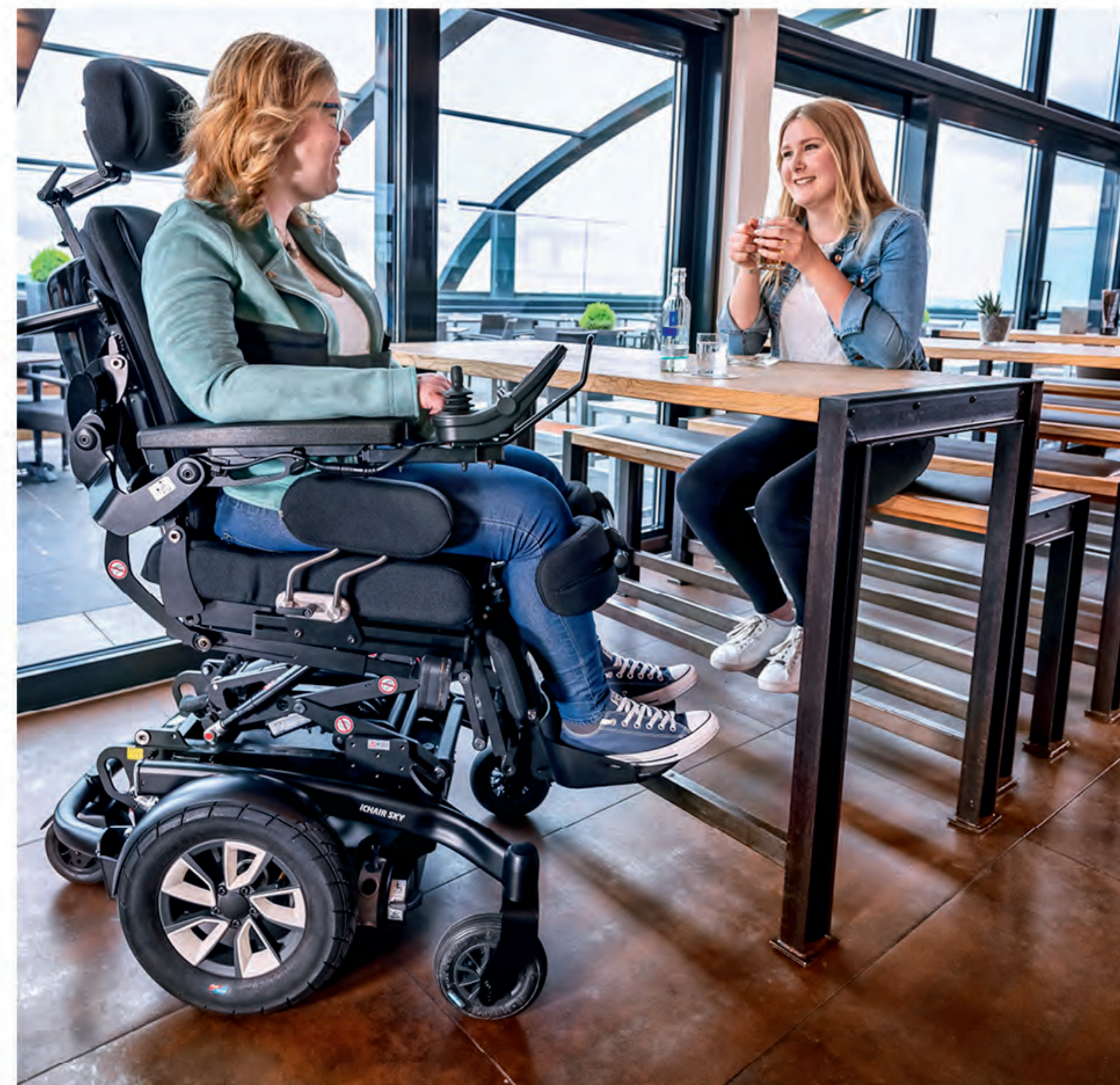
Electric lift up to 200 mm as standard feature, automatic speed adjustment on the move