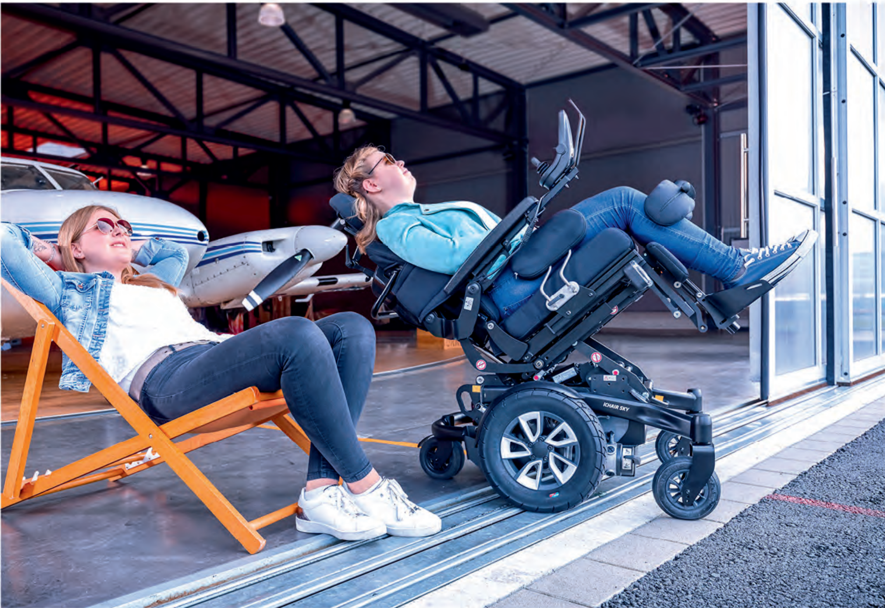
PERFECT RELAX POSITION The 0° to 40° seat tilt enables the ideal relax position to be set for balancing out pressure. When travelling in a tilted position, the speed is automatically adjusted.