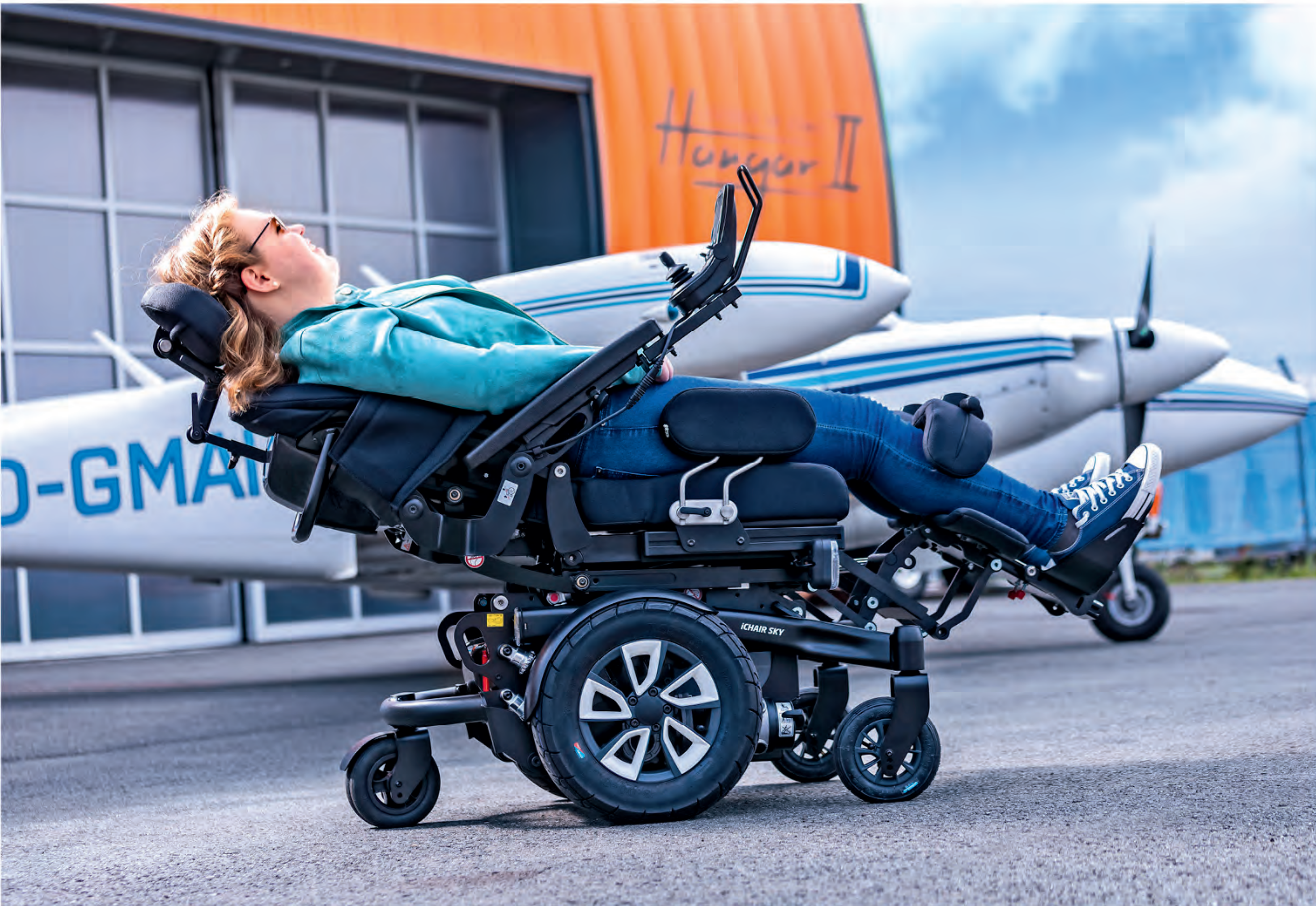
Optional: The advanced lie-down function with biomechanics for armrests and headrest improves the ergonomics while lying down by supporting the head and lowering the armrests to 45°.