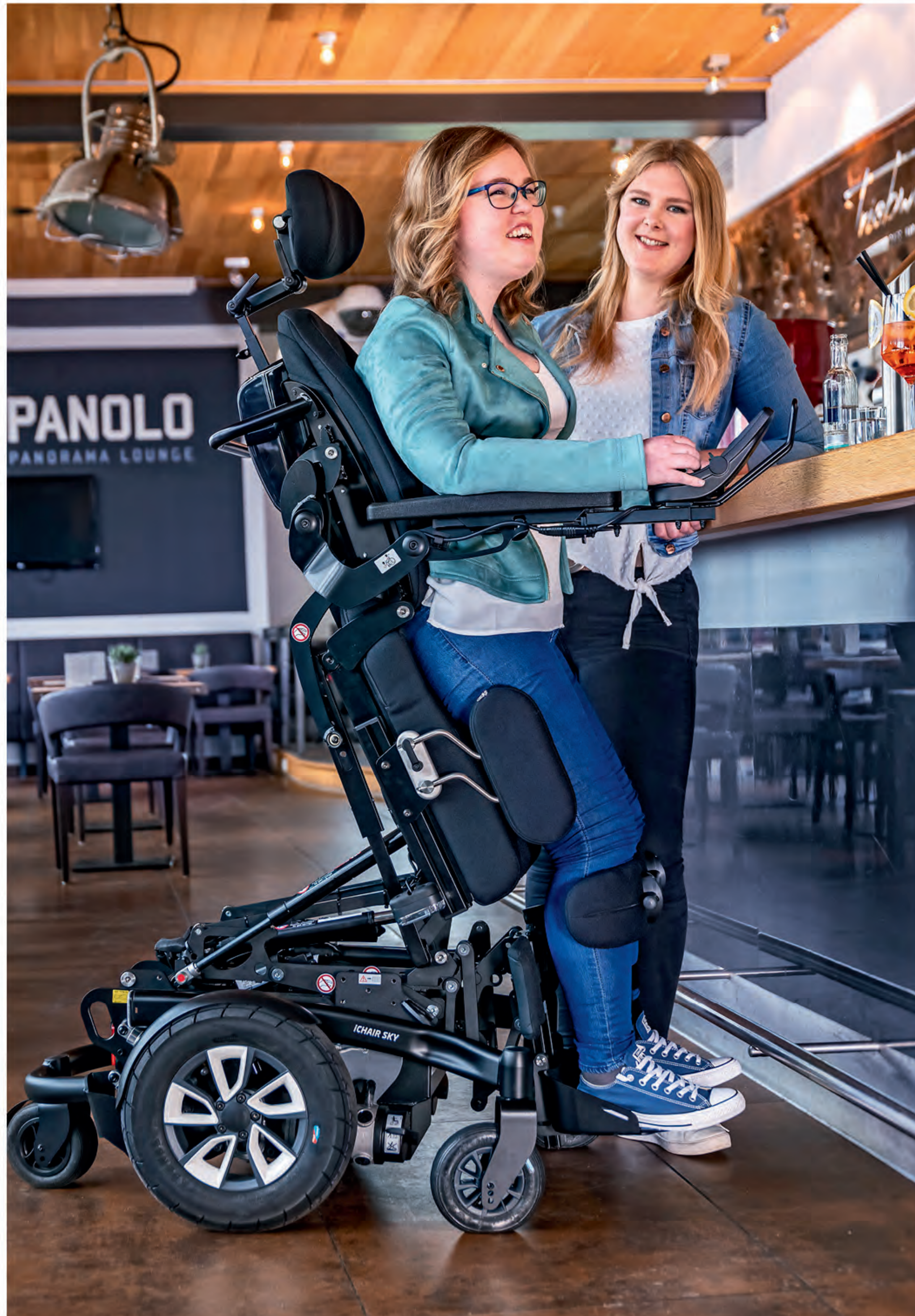
Large stand-up angle up to 90°, chest strap included, stand-up ride (3 km/h), standing up possible from any position