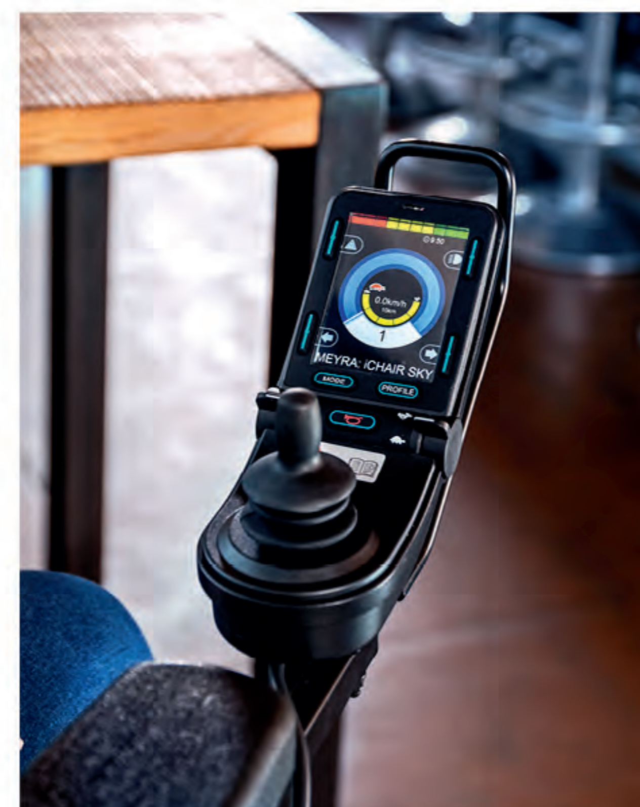
Multifunctional module with memory function The iCHAIR SKY enables other positions in addition to the stand-up function and the seat lift. Find out more on the next page!